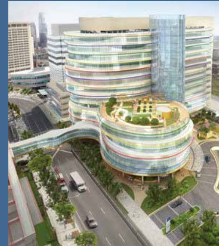
The new CHOP Bueger Ambulatory Care Center opening in 2015