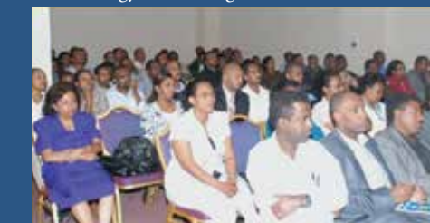
Participants of the 2012 CME course.