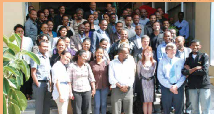
RSE officers with CME course attendees